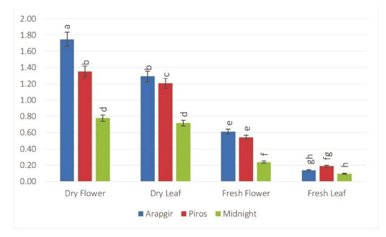
Fig. 2. Variation of essential oil contents according to the genotypes and parts of plant interactions.

the plant parts of basil are consumed as both fresh and dry (Makri and Kintzios 2008). It was reported that the essential oil ratio of basil harvested at different times during the day varies according to the plant parts (Chang et al. 2009). Results obtained from this study are similar to the findings of Chang et al. (2009).